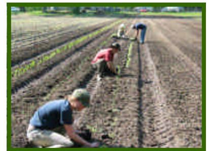
The crew transplants flowers in the pick your own field